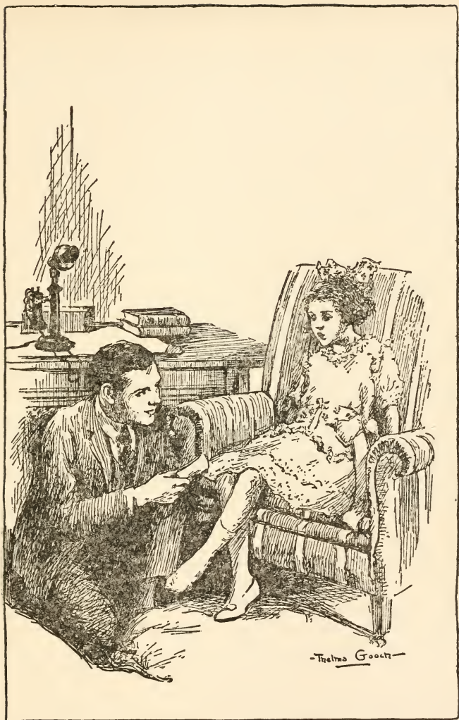
She sighed with relief as the offending shoe came off. (Page 7)